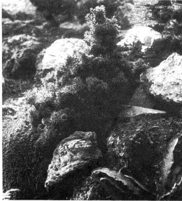
Picea abies 'Zdena'

The photo shows Picea abies 'Zdena', a genetic mutant found near Chvalcov village (in the Olomouc region of CSSR) in May, 1968, by a friend of mine.